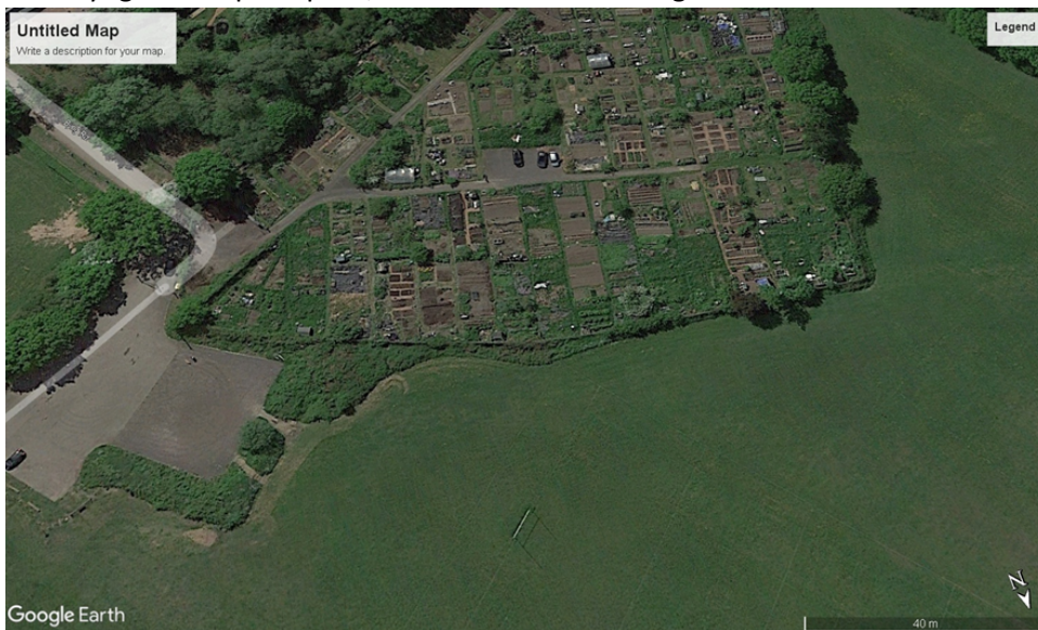
Figure 1: Google Earth View from May 2019

The previous hedge ran along Byng Road Allotments and was mainly made up of brambles with a three large trees on the west side of this hedge. Some parts of the hedge protruded up to 5 metres onto Byng Road Open Space, as seen in the following aerial views of our allotments.