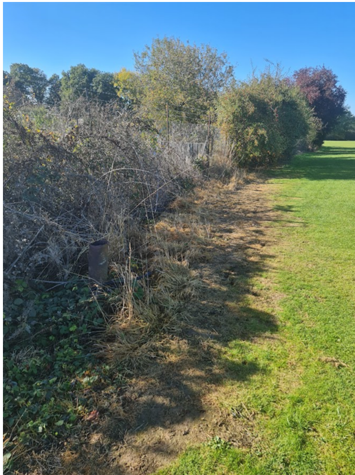
Figure 4: Taken 18 October 2022.