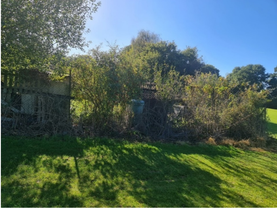
Figure 3: Taken 18 October 2022