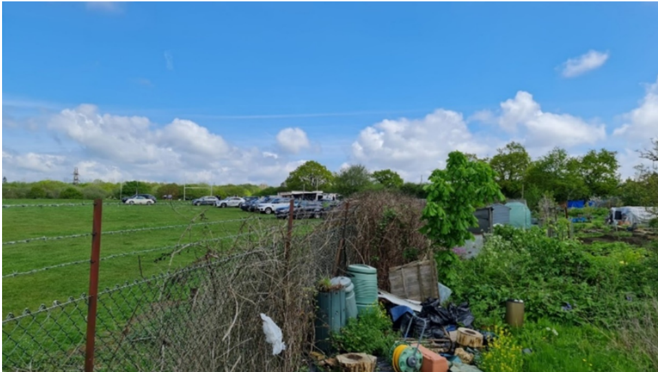
Figure 5: Taken on Sunday 7 May 2023 at 1.28pm.

Since 2017, car parking, hence car usage and pollution have significantly increased with the opening of Noah's Ark Children's Hospice, with 33 cars parked at Byng Road Playing Fields on Thursday 6 July 2023 most of which is staff from the Noah's Ark Children's Hospice. In addition to this, BERFC use Byng Road Playing Fields as an overspill car park to meet their demand, as shown in the following photograph.