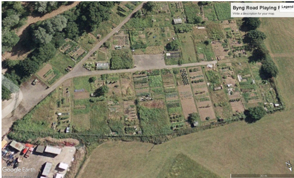
Figure 2: Google Earth View September 1999

Unfortunately, Google Earth does not have any aerial views before this time, but the hedge was started in 1952 when 5.25 acres [1] of Field 1038 (now Byng Road Playing Fields) was appropriated by the Ministry of Local Government and Planning for permanent allotments (Parks and Open Spaces Committee, 1 May 1951) and tenants planted blackberries along this perimeter to deter thefts, as a fence was not installed around Byng Road Allotments until 1960 (Allotments Committee, 5 July 1960) at a cost of £200.